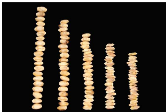
- Variation in Seed Size (20 seeds/row)

Results from this trial followed a similar pattern to the winter wheat study done by Dr. Beres.