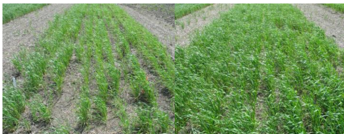
- Weak agronomic system: untreated (left) vs. seed treatment (right).

Overall, gains observed to grain yield by using seed treatments or larger seed were significant, but relatively modest. Therefore, economic implications must be considered for each agronomic system to properly evaluate the risks and benefits. Yield responses were greatest in a weak agronomic system and tended to diminish with a stronger agronomic system.